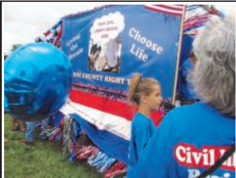
View before the parade