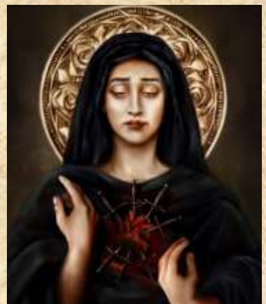
Month of Our Lady of Sorrows